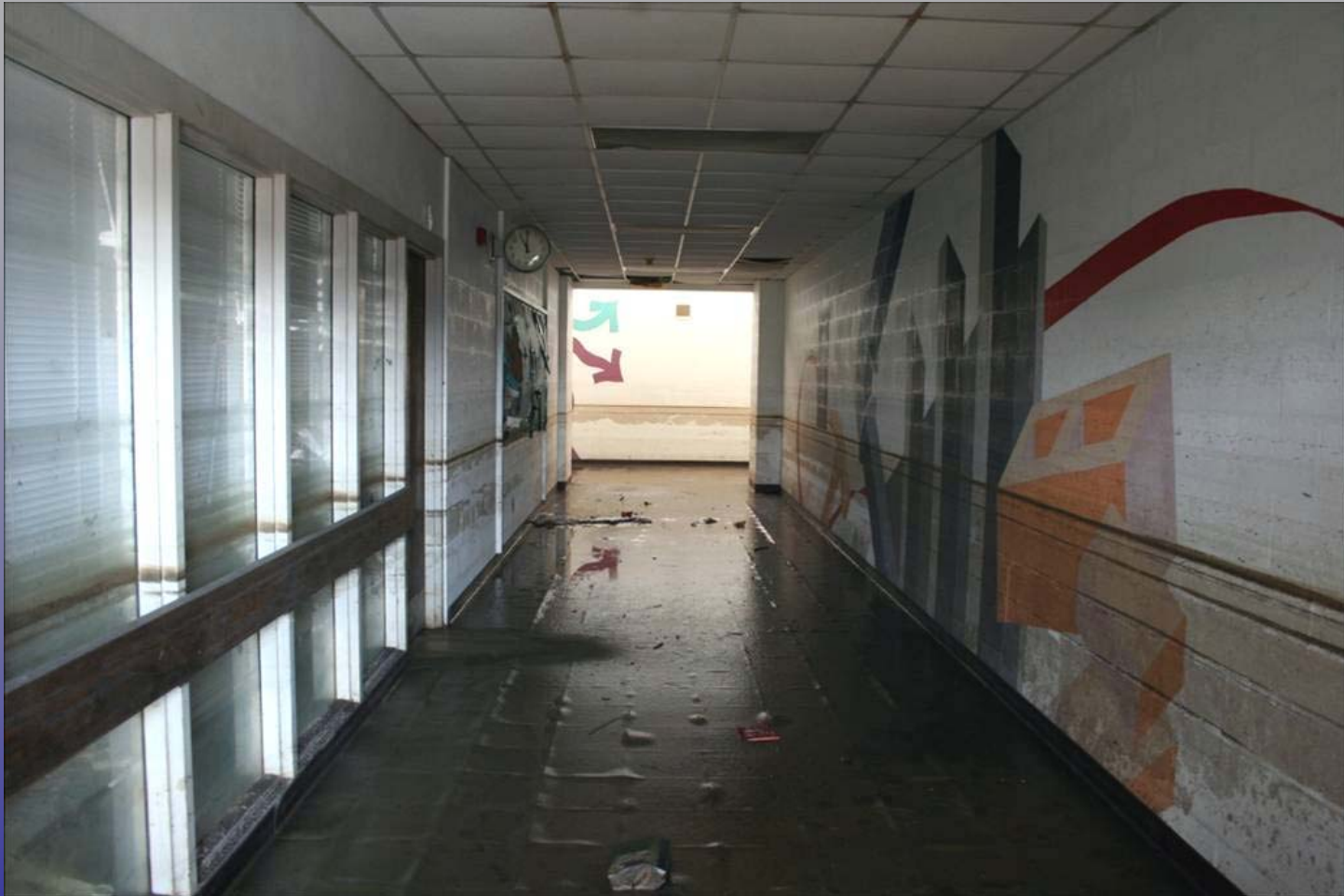
Sidney Collier Campus Louisiana Technical College