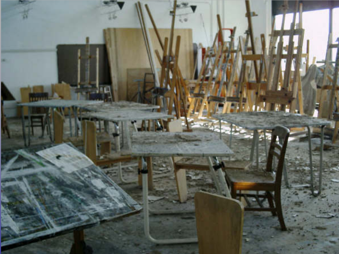
Building 1 (Fine Arts Building) Delgado Community College