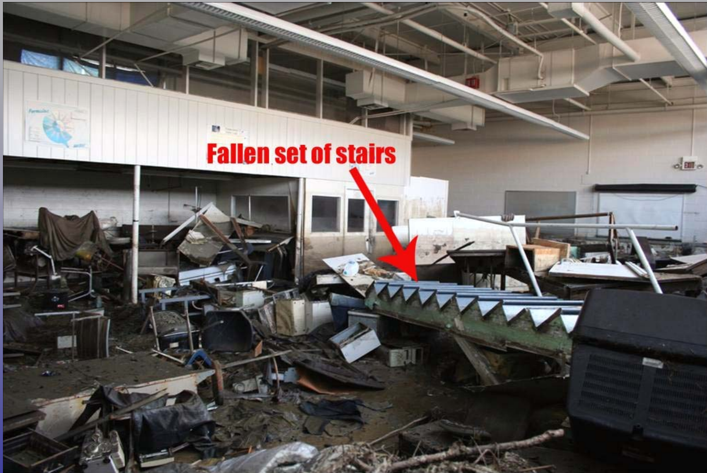
Sidney Collier Campus Louisiana Technical College