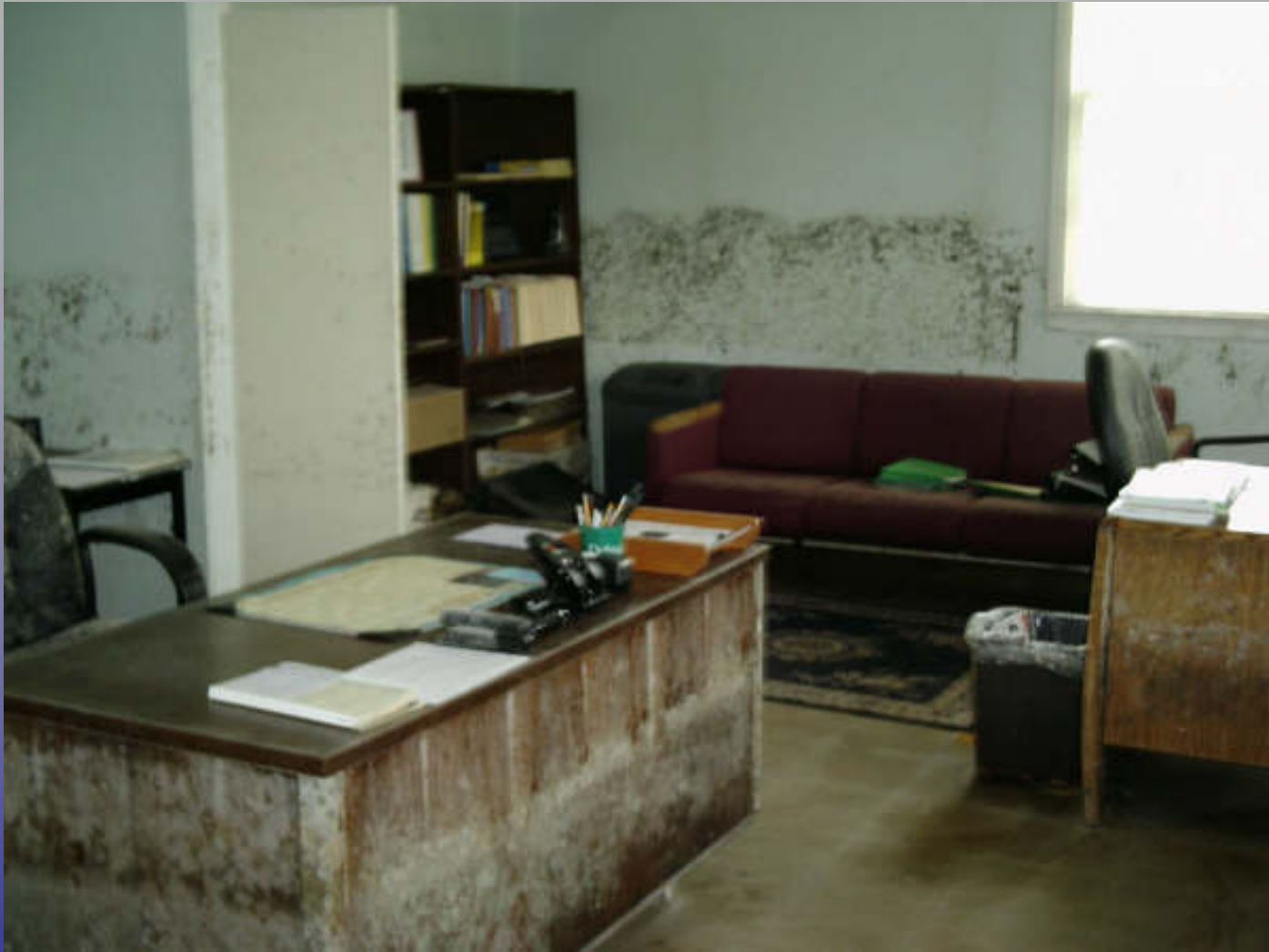
Office Delgado Community College