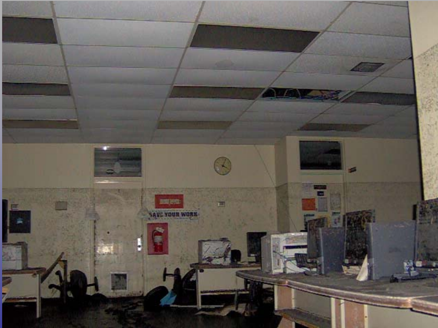
Administration Building Nunez Community College