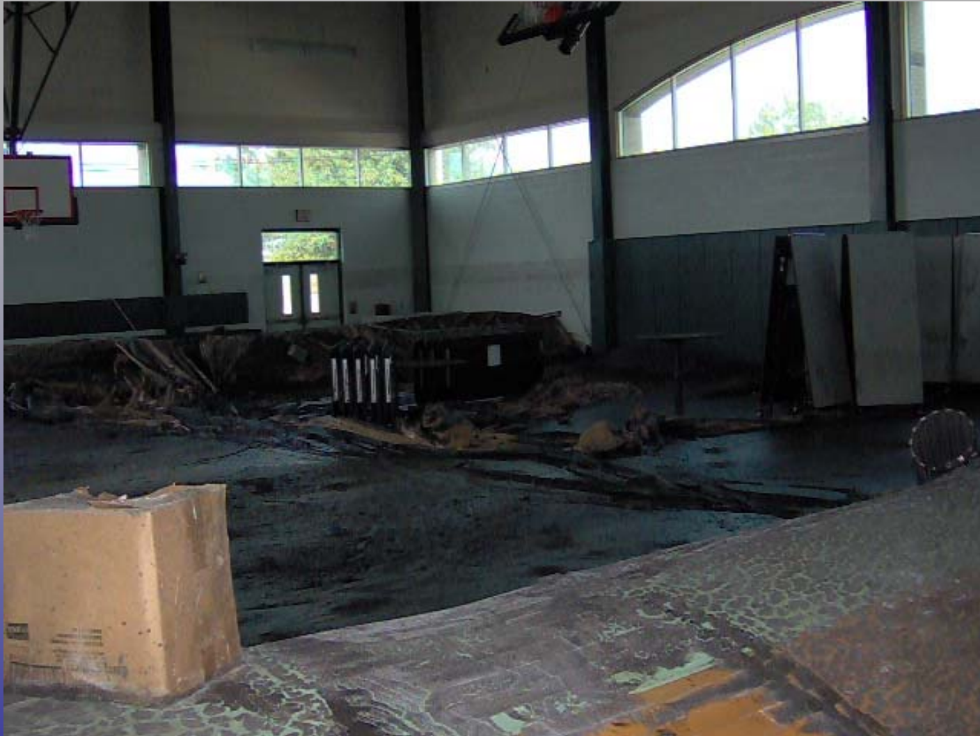
Gymnasium Nunez Community College