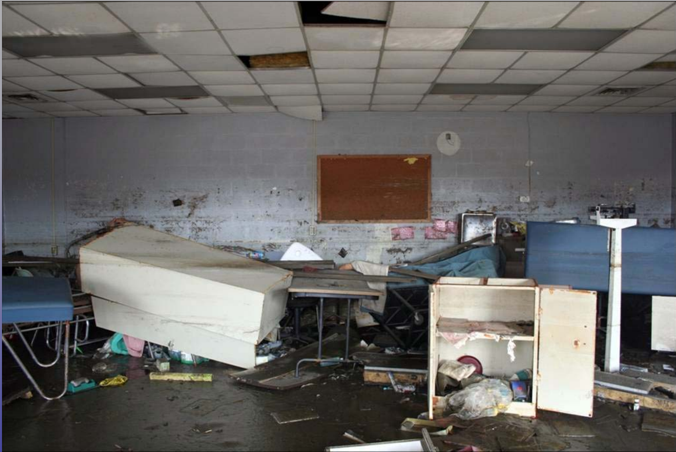
Sidney Collier Campus Louisiana Technical College