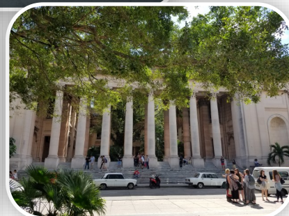
Cuban photos courtesy of Van Devender